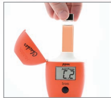
Place the cuvette into your Checker®HC