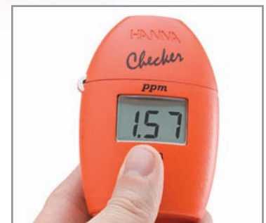
Press the button and read the results. it's that easy!