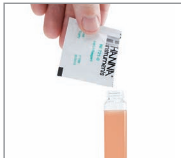
Add reagent to your water sample