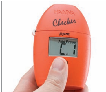
"Zero" the Checker®HC with your unreacted water sample